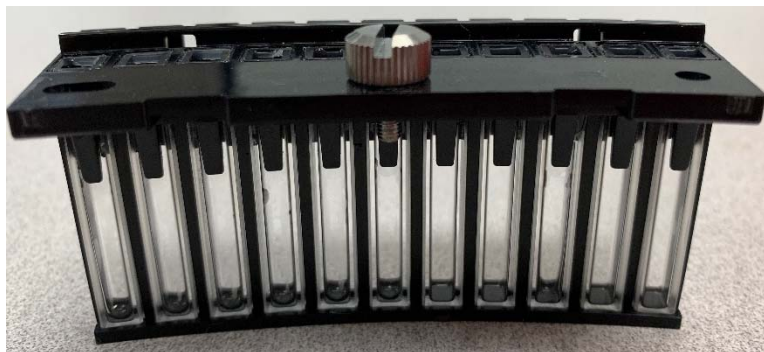
Alinity c Cuvette Segment

The following picture shows normal, undamaged cuvette segment: