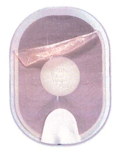
Figure 1 : Separated gel that has folded onto itself when peeled.

It is also possible that the gel could separate almost completely from the foam/tin backing when peeled, (see Figure 3 .) Due to a small amount of gel surface contact area with the skin, electrical arcing could occur when a shock is delivered leading to burns to the patient's skin, or the AED could be unable to deliver any shock through the pads. A delay in therapy will result while the user installs a replacement pads cartridge (if available) or performs CPR while waiting for Emergency Medical Services Personnel to arrive. For comparison, Figure 4 shows a normal pad. No matter the state of the pad, follow the voice prompts because the AED will step you through the necessary actions.