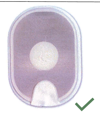
Figure 4: Normal pad.