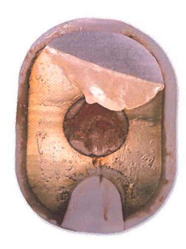
Figure 2 : Separated, folded gel may also have a discolored and/or melted appearance.

Action: Apply pads to the patient. Do not hesitate.