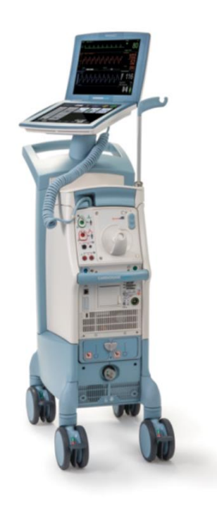
Figure 3: Cardiosave in Hybrid Configuration