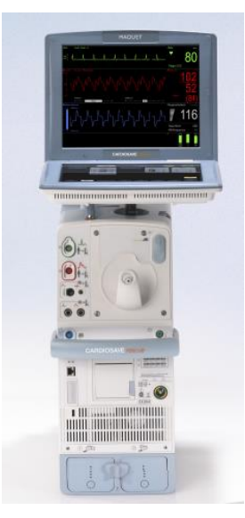
Figure 4: Cardiosave in Transport Configuration

An unexpected shutdown upon battery removal cannot occur for Cardiosave Rescue.