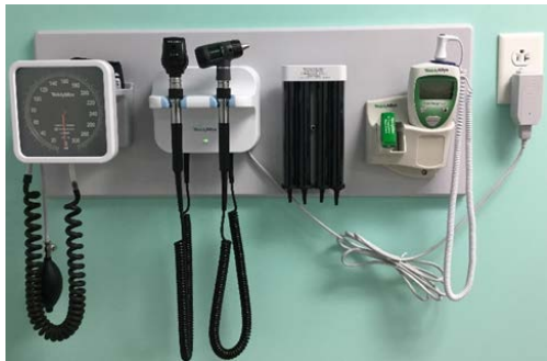
GS777 Wall Transformer