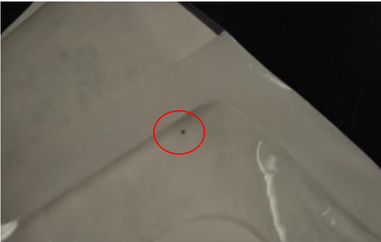
Figure 1: Foreign material located within the accessories pouch