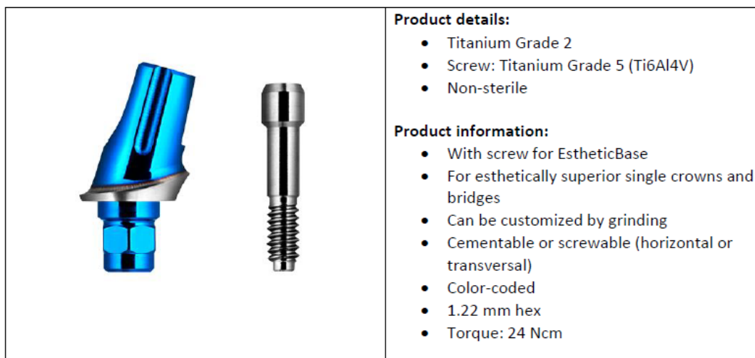
Friident EstheticBase, angulated, D 4.5, GH 1, A 15

Friident EstheticBase abutments are available in angulations of 0° (straight) or 15° (angulated) to the implant axis. The abutments are manufactured from titanium grade 2 and titanium alloy (Ti6Al4V grade 5). Above the implant connection, the abutment is provided with an anatomically shaped preparation line with the respective gingival height (GH1, GH2, GH3 or GH5 mm). The EstheticBase abutment is delivered together with a respective retaining screw to tighten the abutment on the implant. All EstheticBase abutments and screws are delivered non-sterile.